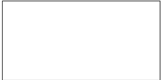
This space may used for the Prescriber's Address Stamp

Prescriber's Signature: _____ Date: _____ (Original signature or signature stamp ONLY)